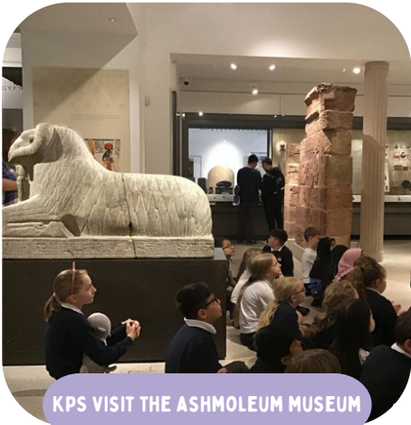
KPS VISIT THE ASHMOLEUM MUSEUM