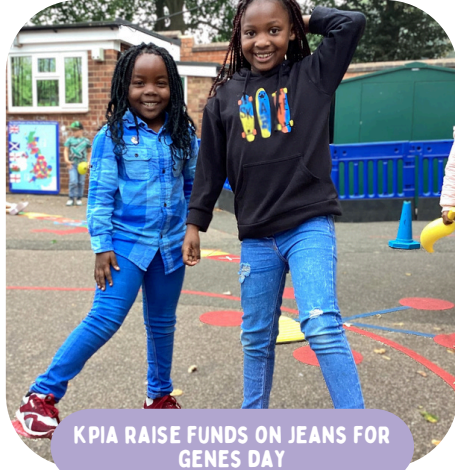
KPIA RAISE FUNDS ON JEANS FOR GENES DAY