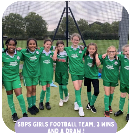
SBPS GIRLS FOOTBALL TEAM, 3 WINS AND A DRAW!