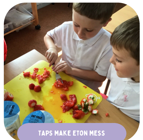
TAPS MAKE ETON MESS