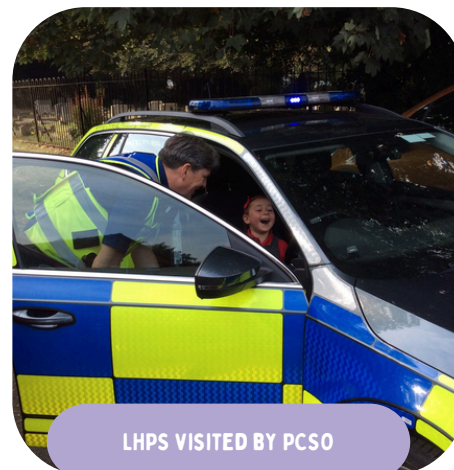
LHPS VISITED BY PCSO