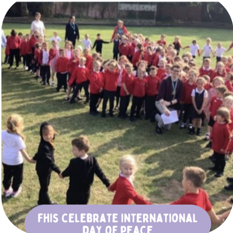
FHIS CELEBRATE INTERNATIONAL DAY OF PEACE