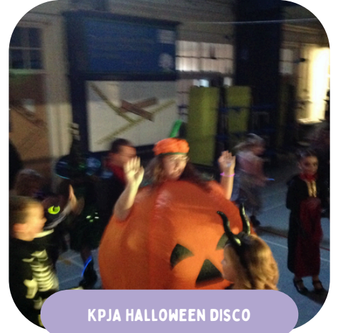
KPJA HALLOWEEN DISCO