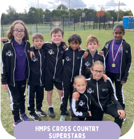
HMPs CROSS COUNTRY SUPERSTARS