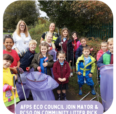
AFPS ECO COUNCIL JOIN MAYOR & PCSO ON COMMUNITY LITTER PICK