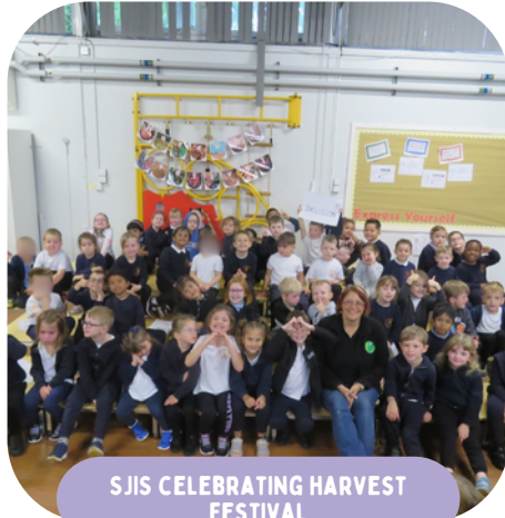
SJIS CELEBRATING HARVEST FESTIVAL