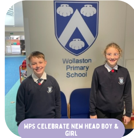
WPS CELEBRATE NEW HEAD BOY & GIRL