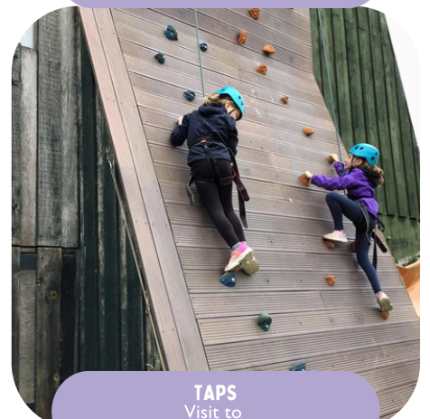
TAPS Visit to The Frontier Centre