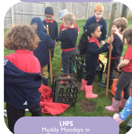
LHPS Muddy Mondays in Reception class