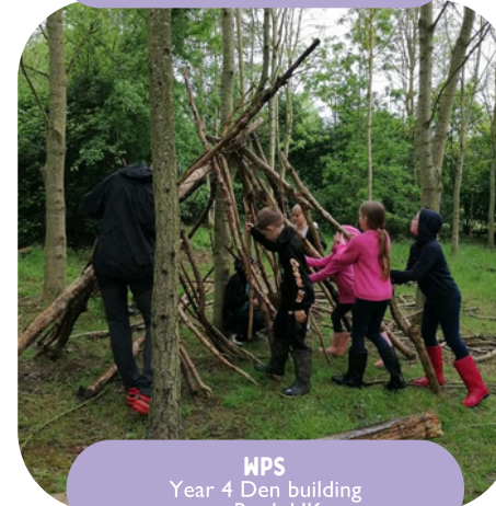
WPS Year 4 Den building at Rock UK