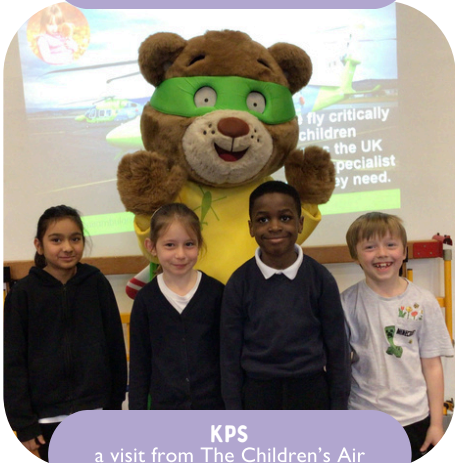
KPS a visit from The Children's Air Ambulance Service