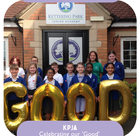
KPJA Celebrating our 'Good' rating from Ofsted