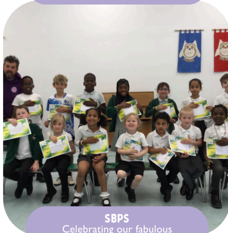
SBPS Celebrating our fabulous BEST of the week children