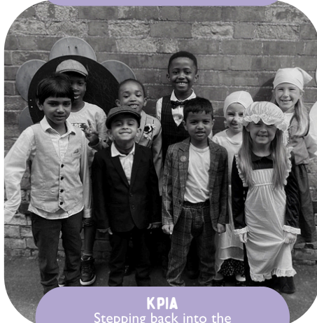
KPIA Stepping back into the 17th century for WOW day