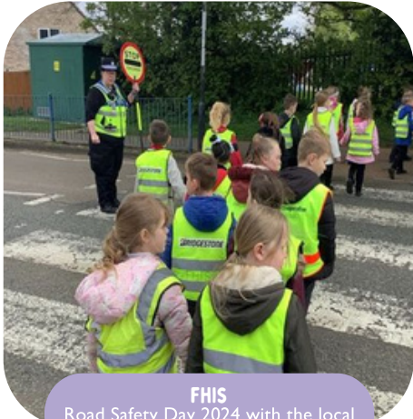
FHIS Road Safety Day 2024 with the local community Policing team