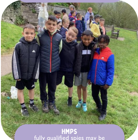
HMPS fully qualified spies may be spotted at Hall Meadow