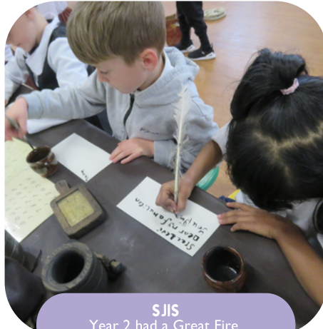
SJIS Year 2 had a Great Fire of London workshop