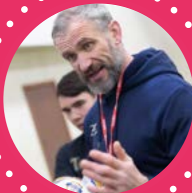
Jamie Peacock MBE Be A Champion

“I am looking forward to helping pupils find their inner champion and make a difference to their wellbeing.”