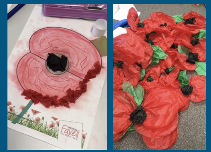
We have had a fantastic first term back here at Standens Barn and we are looking forward to what comes next throughout the rest of this academic year.

The Year 5 children had a great time and produced fantastic work. These will now be used as part of a large remembrance display at Weston Favell Centre in November.